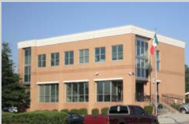
336 E. Six Forks Road