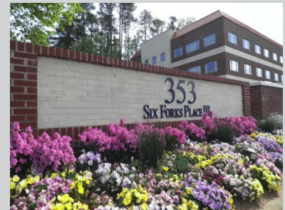
Six Forks Place III