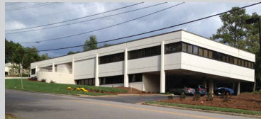
Anderson Plaza West