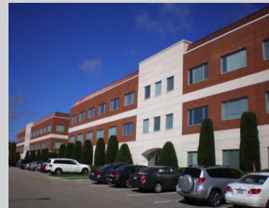
Six Forks Place II

For more on these properties go to www.hobbsproperties.com/for-lease