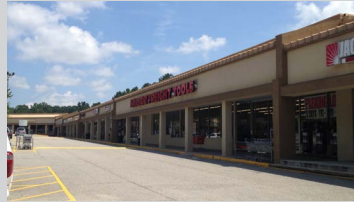
Starmount Shopping Center