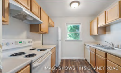
IMAGE SHOWS 1015 CHANEY ROAD