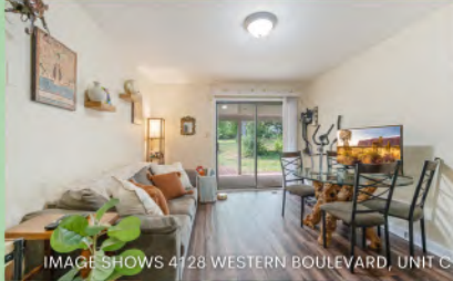
IMAGE SHOWS 4128 WESTERN BOULEVARD, UNIT C