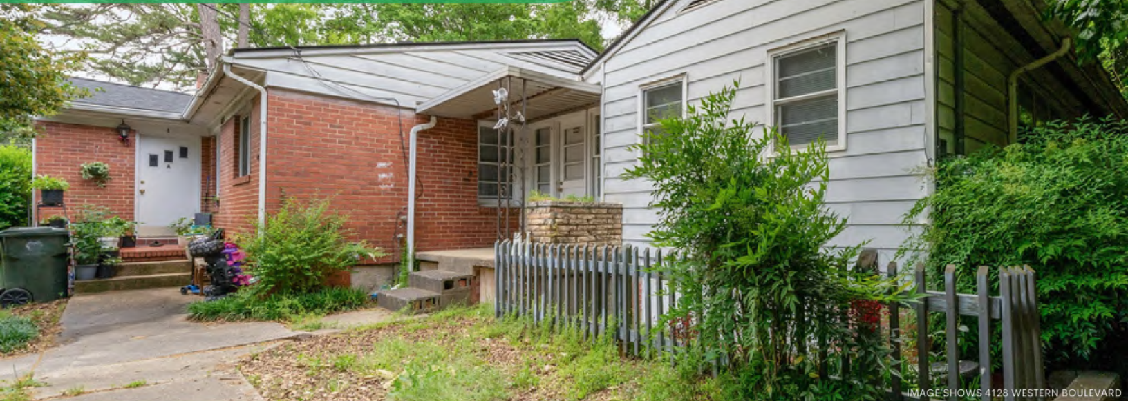
IMAGE SHOWS 4128 WESTERN BOULEVARD